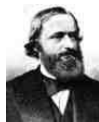
G. R. Kirchhoff 1824–1887

A disability incurred in an accident forced Kirchhoff to use crutches or a wheelchair. There is a crater on the moon named for Kirchhoff.